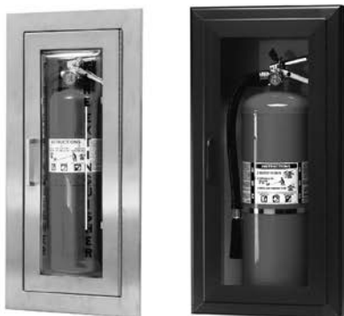
LARSEN'S FIRE RATED EXTINGUISHER CABINETS