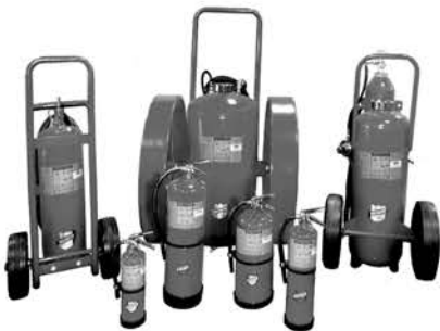
NEW Off Shore Line

Buckeye Fire Equipment, a world leader in the fire protection industry, has assembled over 100 years of experience in gas and flame detection, system applications, sales, and service.