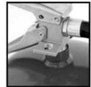
Featuring a universal valve body with new wall hook