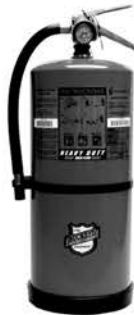
NEW Heavy Duty High Flow

For more information about our wide selection of products and services, please visit www.buckeyefire.com or call 704.739.7415.